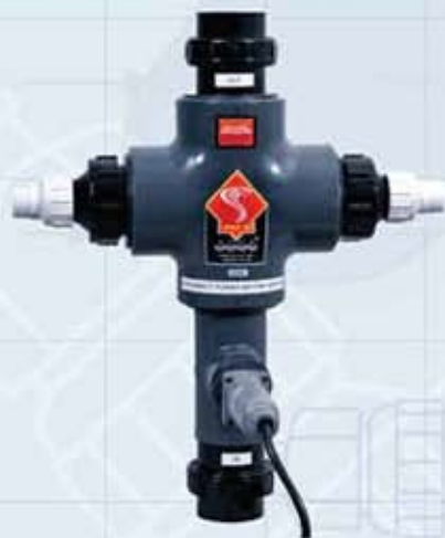
400 Watt with 2" Inlet/Outlet & 2" Flowswitch

Designed for maximum performance, power and reliability.