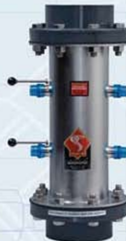
800 Watt with 6" Inlet/Outlet with Wiper