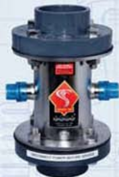
400 Watt with 3" Inlet/Outlet