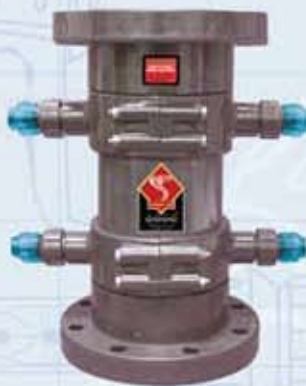
800 Watt with 6" Inlet/Outlet